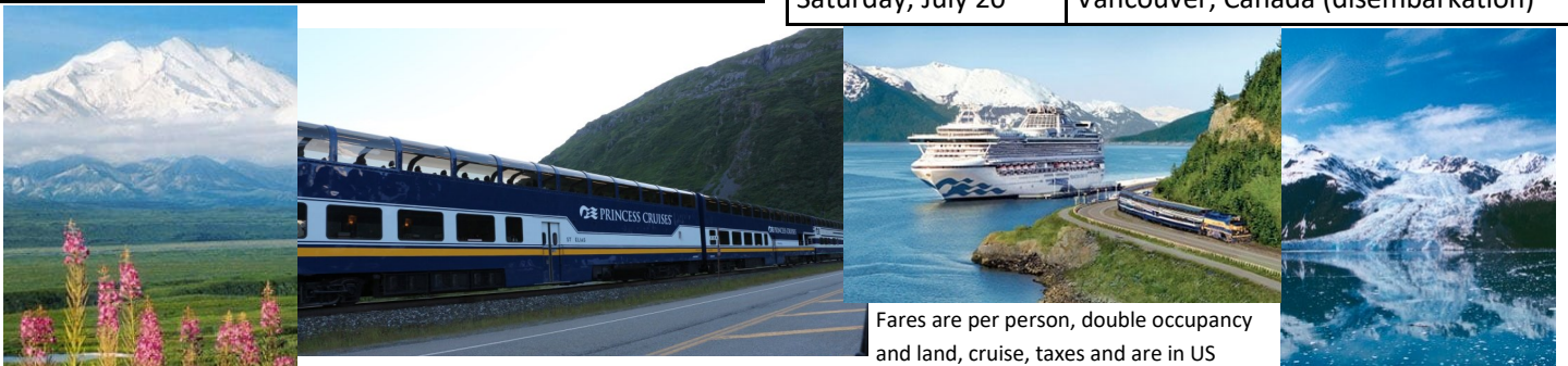
Fares are per person, double occupancy and land, cruise, taxes and are in US

dollars. Fares subject to availability and may change. Travel must be booked through AAA Travel to receive savings and AAA Exclusives. Tour, hotels, itinerary and exclusive amenities are capacity controlled and based on a minimum number of passengers traveling together and may be modified, withdrawn or cancelled without prior notice. Not combinable with any other offer or promotion. Travel insurance not included and recommended. Passport requirements are based on US Citizenship (other nationalities will have different requirements). Cancellation and change fee apply. Other restrictions may apply. Contact your AAA Travel Consultant for complete details. The Auto Club Group is not responsible for errors or omissions in the printing of this document. Princess® ships are of British and Bermudan Registry.